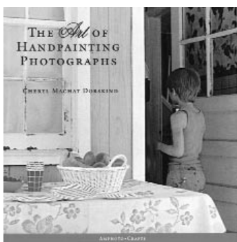
The Art of Handpainting Photographs Amphoto Books, 1998